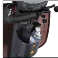
Extra storage & Shopping bag hook.