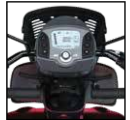
Digital LCD Dashboard Display.