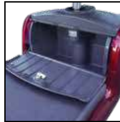
Lockable storage drawer underneath the seat.