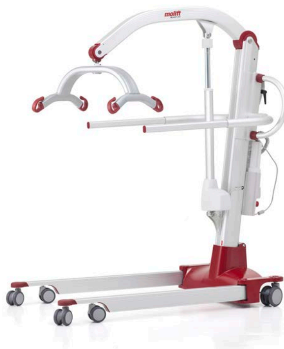
Molift Mover 300 with supporting arm

Molift Mover 300 has the high hoisting capacity of 300 kg. It is the ideal solution for hospitals and care facilities with bariatric clients who have frequent and everyday moving and handling needs. With its low weight and high capacity, it is one of the lightest in its category.