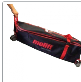
Soft travel bag