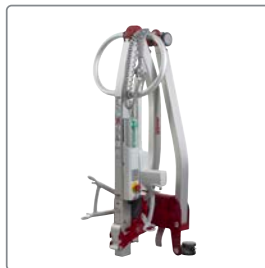
Molift Smart 150 folded