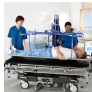
...or lift supine patients on stretchers.