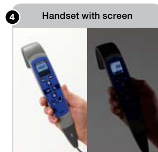
4 Handset with screen User friendly hand control with a colored and illuminated screen.