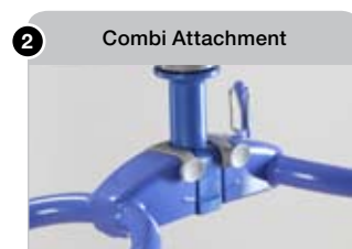
2 Combi Attachment The Combi attachment enables easy interchanging between spreader bars and stretchers.