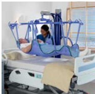
An optimum solution for supine lifting of patients in acute care...

There is no such thing as a typical patient or a typical care facility. That is why Maxi Move has been designed as a complete system with the flexibility to provide patient-specific solutions in any care environment.