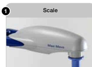
1 Scale Built-in electronic scale shows resident's weight on the display of hand control.