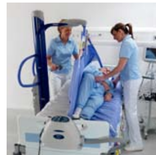
...or for repositioning and turning patients in bed.

Good stability is fundamental for safe operation of the lifter and the patient's sense of security during transfers. Maxi Move is based on a vertical lifting principle that assures excellent stability – SVS (Stable Vertical System).