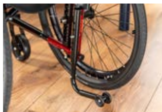
• Anti-tipper (optional)

For additional options, please refer to the order form.