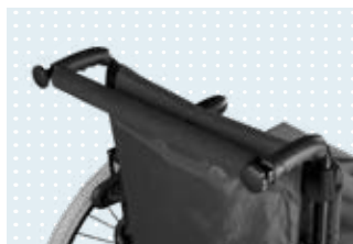
• Stabiliser bar (optional)