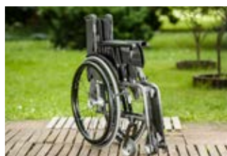
• Folds up easily to save space