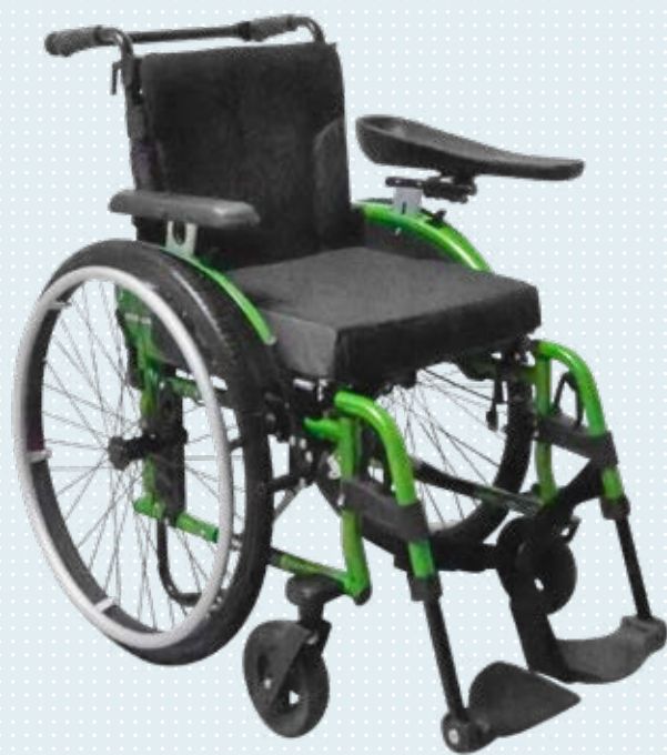
Motus HEMI The functional option Page 18

The Motus HEMI variant was designed especially for the needs of stroke patients and includes various special options to make their lives easier. For example, it can be propelled with one hand.