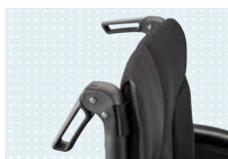
• Folding push handles (optional)