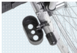
• Crutch holder (optional)