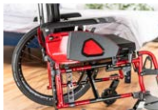
• Side desk panel with adjustable depth (optional)