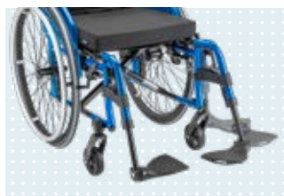
• More room to manoeuvre with swing-away (alternatively: swing-up) leg supports