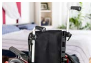
• Height-adjustable push handles (optional)

For additional options, please refer to the order form.