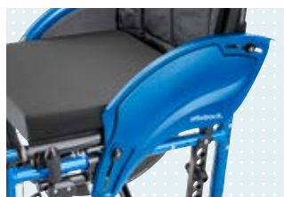
• Side panels can be painted to match the colour of the frame (optional)