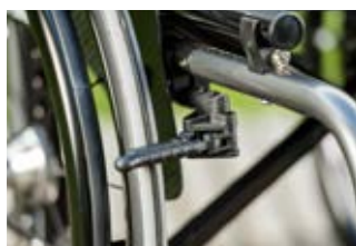
• Scissor wheel lock (optional)

For additional options, please refer to the order form.