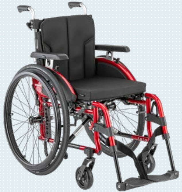
Motus CV The variable option Page 14

i Further technical data and detailed information to the products can be obtained directly from your specialist dealer or refer to the respective instructions for use.