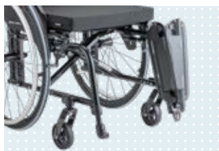
• Foldable, single-panel foot plate