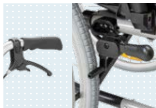
• Knee lever wheel lock for user and attendant (optional)