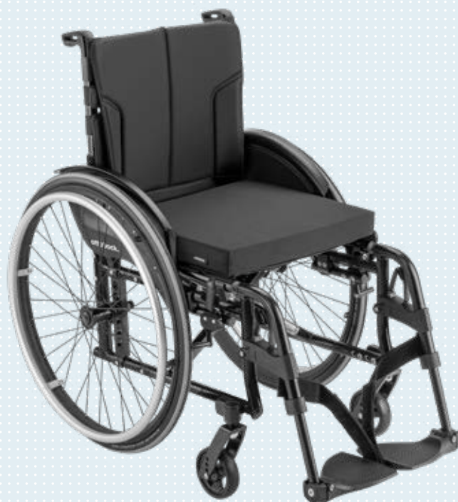
Motus XXL The sturdy option Page 20