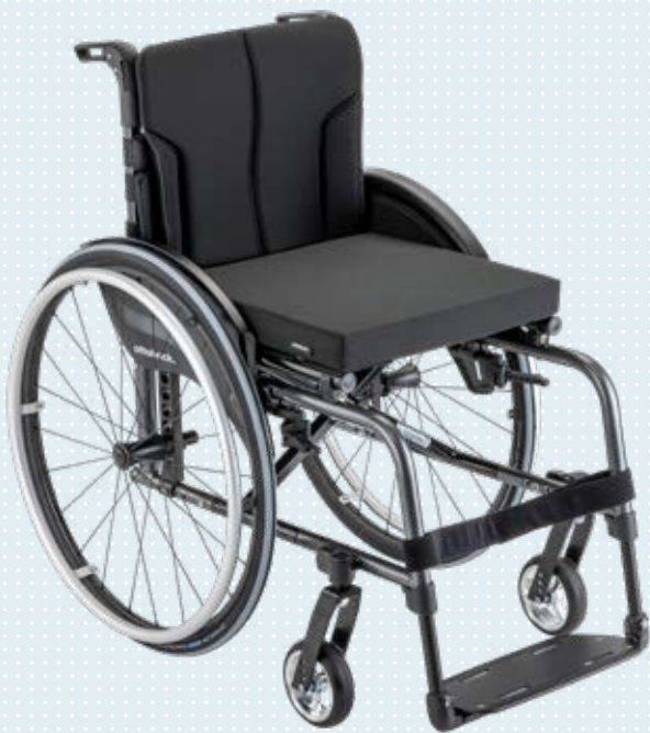
Motus CS The sporty option Page 10

Having undergone a complete makeover, the Motus has now emerged with more product highlights than ever before – lighter weight, a new design, a wider range of frame colours, and more features that can be set individually. All models can be adjusted to the user’s individual requirements and can be folded up quickly for transport.