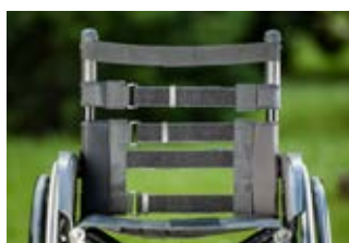
• Individually adaptable back support