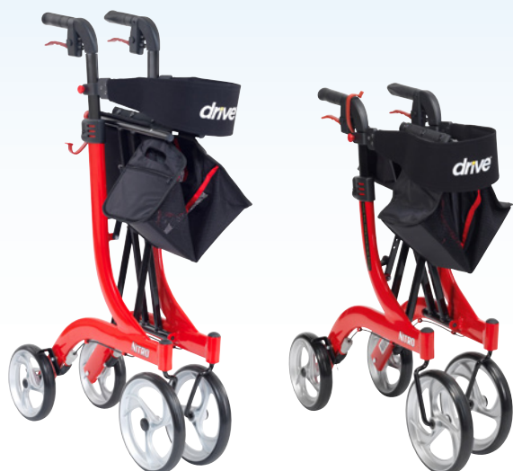
Easily folds with one hand to a compact size for storage and portability

The Nitro Rollators were developed with a contemporary design in mind, featuring a lightweight aluminium frame and stylish tri-spoke wheels for easy manoeuvrability.