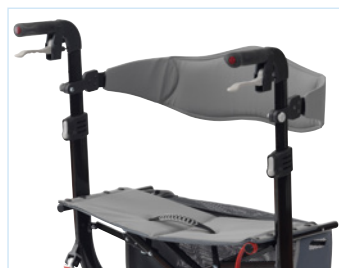
Soft, flexible backrest and seat providing great comfort