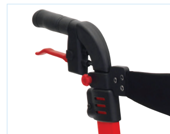
Internally routed brake cables for added safety