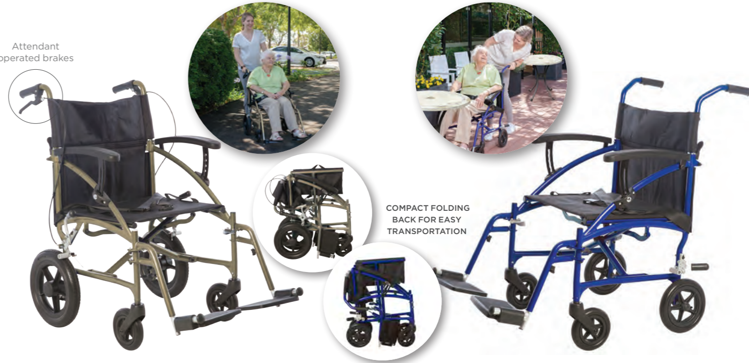
Attendant operated brakes

The Aspire LITE is an 'ultra lightweight' wheelchair that is ideal for occasional use. The Aspire LITE is designed with the carer in mind. The compact, lightweight frame makes it easy to transfer in and out of a car. The push button, height adjustable armrests make it versatile, allowing the user to be positioned at a table and quickly adjusted for comfort.