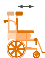
SEAT DEPTH ADJUSTABLE